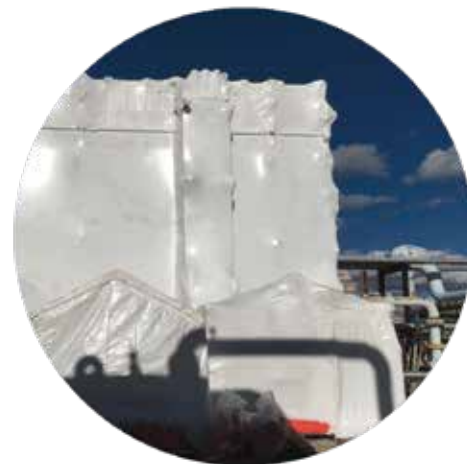
The Ultimate Environmental Containment System

Enviro-Vac's shrink-wrap is a state-of-the-art specially formulated, high strength polyethylene film that shrinks when heat is applied. The heated plastic film shrinks to create a perfect fit around any object, framework, or engineered scaffolding, is fire retardant, and has UV inhibitors.