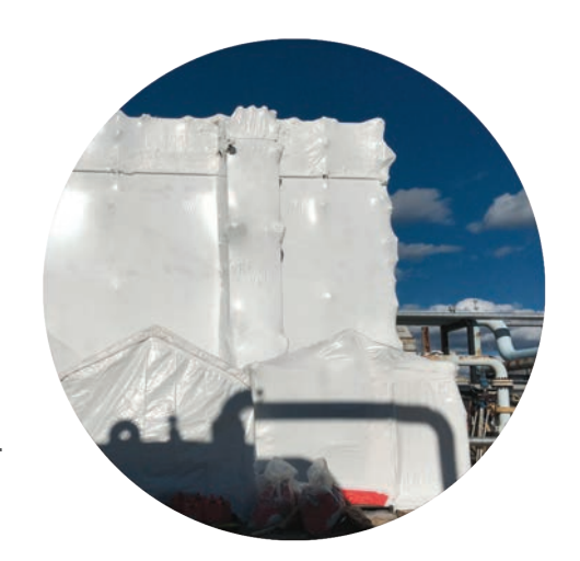
The Ultimate Environmental Containment System

HAZMAT containments, restoration, construction, renovation, painting, sandblasting, demolition, hot work projects, winterization, fire/water damage, shipping and general containment/enclosures/scaffold-netting.