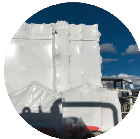
The Ultimate Environmental Containment System

Enviro-Vac's shrink-wrap is a state-of-the-art specially formulated, high strength polyethylene film that shrinks when heat is applied. The heated plastic film shrinks to create a perfect fit around any object, framework, or engineered scaffolding, is fire retardant, and has UV inhibitors.